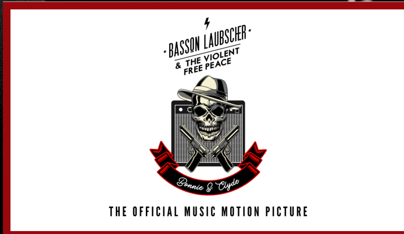
BONNIE & CLYDE